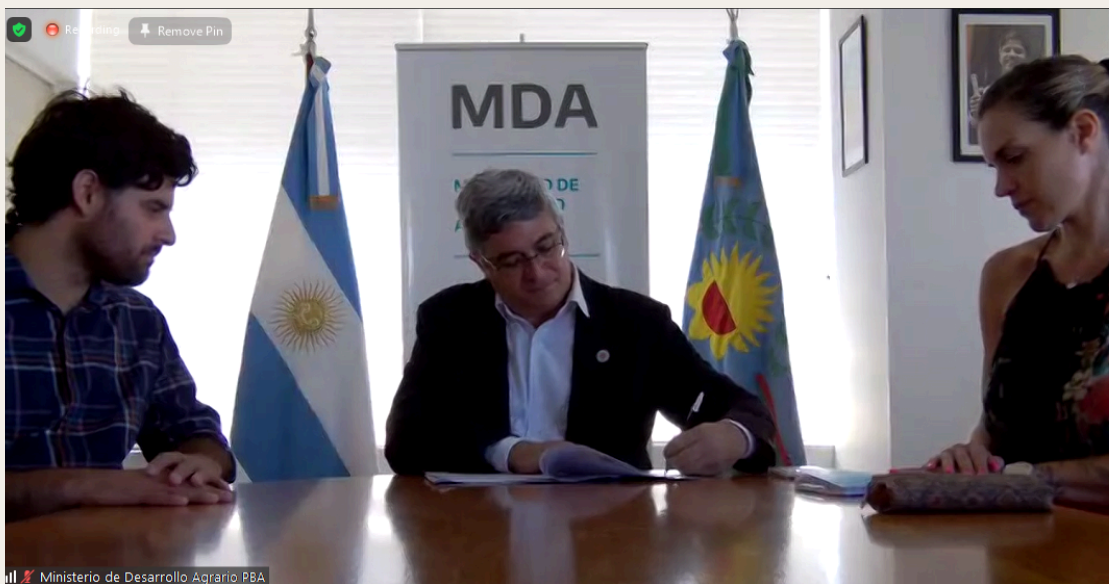
Signing of the Memorandum in Argentina