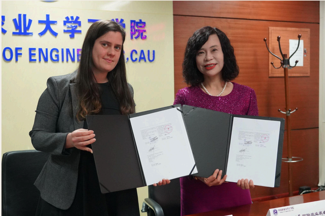
Signing of the Memorandum in China.