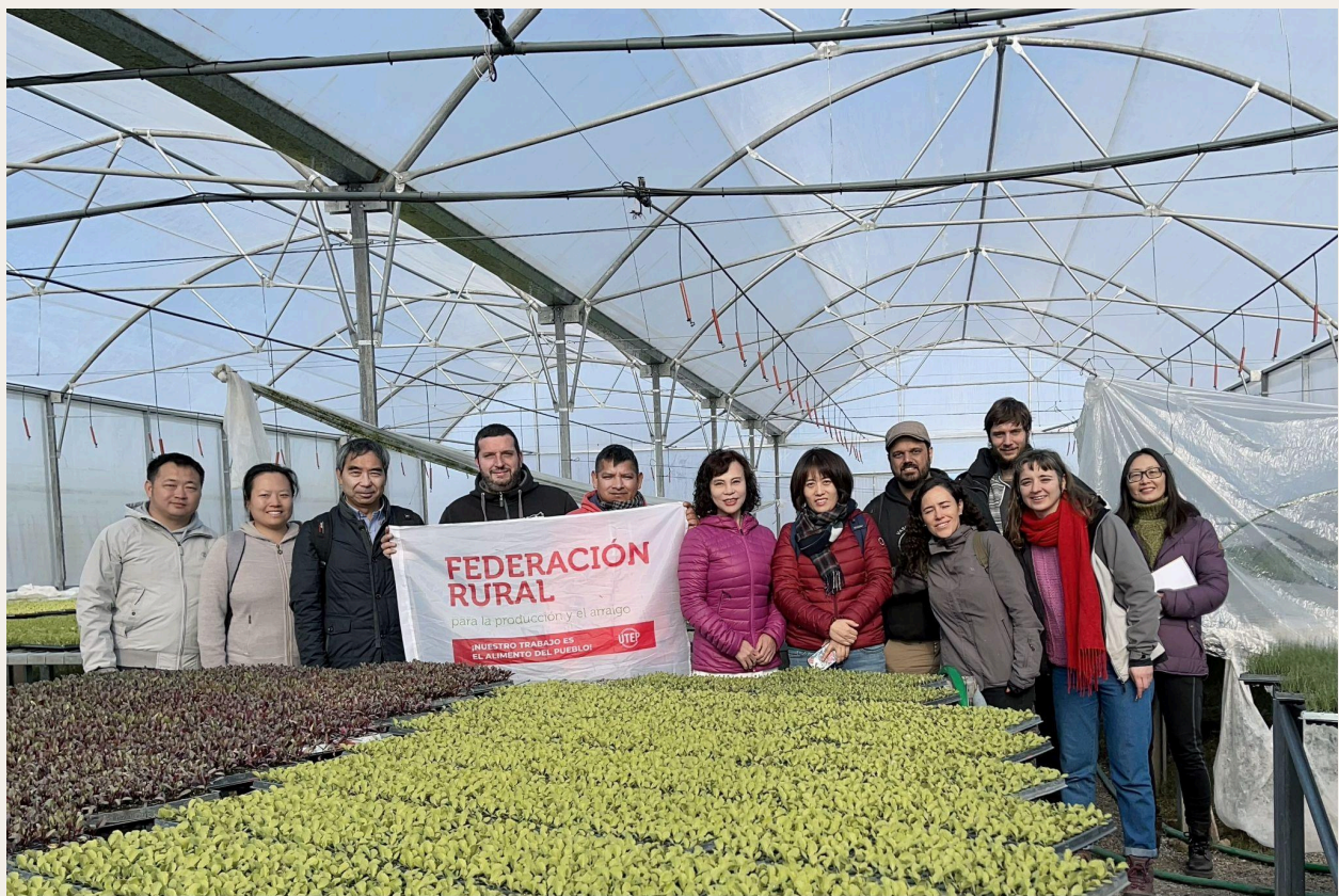
Visit of the Chinese delegation to one of the productive units of the Rural Federation, located in the most important horticultural belt in Argentina, in 2023.

Despite the importance of the sector and its productive potential, it has low levels of capitalization and mechanization. The supply of machinery for the family farming sector in Argentina is limited, with little machinery according to its specific needs in terms of scale and production. On the other hand, low levels of capitalization make it difficult for smaller producers to access technology. This results in limitations in productivity, but also in greater physical efforts in the work of producers, especially in vegetable production in peri-urban areas, where production is carried out mainly with human labor force and involves the entire farmer family.